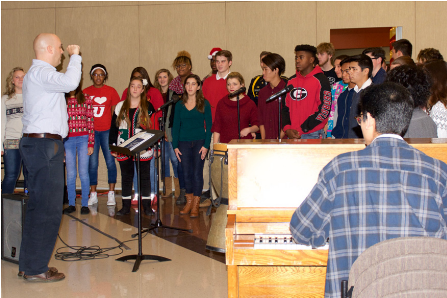
The Waynesville High School Chamber Choir performed for the Rotary Club of Pulaski County on Tuesday. The WHS Choir will host concerts on Saturday, Dec. 17, at 6:30 p.m. and again at 3 p.m. Sunday, Dec. 18, at the WHS Auditorium.

Published by the Waynesville R-VI School District December 16, 2016